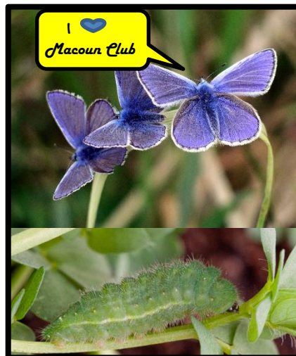
European Common Blue Polyommatus icarus